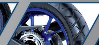
Super Wide Tire