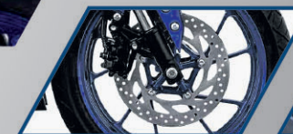
Wide Diameter Front Disc Brake