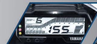
Full Digital Speedometer + Shift Timing Light