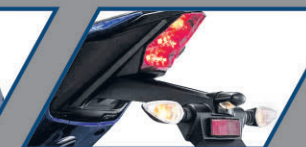
LED Tail Light