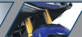
Upside-down Front Suspension