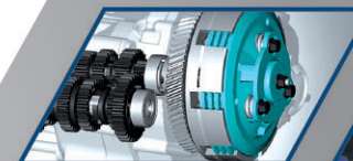
Assist & Slipper Clutch