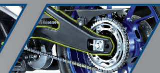
New Design Aluminium Rear Arm