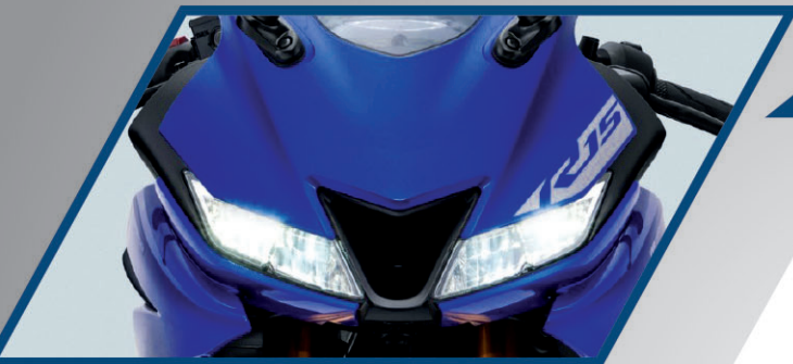
LED Head Light