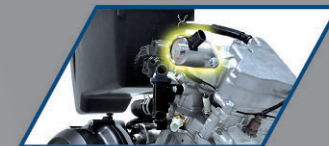
Engine 155cc LC4V with VVA