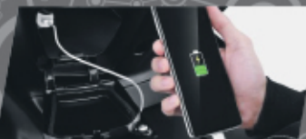
Electric Power Socket