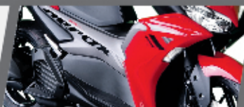
Fully Faired Aerodynamic Look