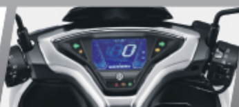
Full Digital Speedometer