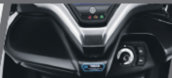
Keyless (Smart Key System)