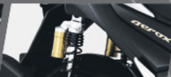
Twin Sub-Tank Suspension