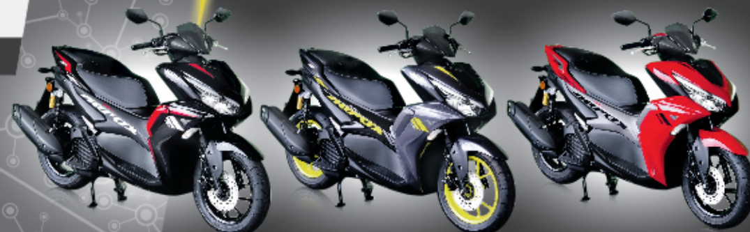
Colour Options : Signature Black, Grey & Red