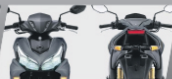
LED Head & Tail Light